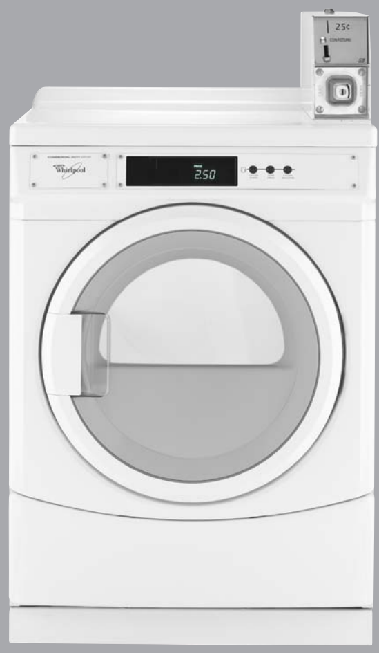
Shown with optional pedestal, coin drop and box.